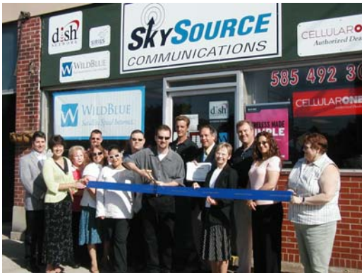
SkySource Communications 235 Main St., Arcade (585) 492-3092 www.sky-source.com