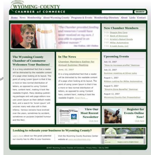
The Chamber's new website is being designed and developed by Delicious Web Design

The Chamber is in the process of overhauling its website to provide greater use and benefit for its members. We anticipate launching the new site before the end of the month. New features will include a fresh homepage with news you can use, enhanced business listings with interactive maps and directions to your business, online program and event registration, and the ability to update any of your member contact information directly from the website, just to name a few. In addition, the new website will have expanded relocation, quality of life and workforce information for newcomers to Wyoming County and those looking to move into the county. And finally, following the launch of the new website members will receive a monthly E-Newsletter to keep you up to date on topics important to your business. So, if you would like to be included on this list, please send your email address to ljlane@wycochamber.org today!