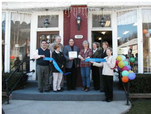
WG Handyside Gallery of Fine Arts 7 South Academy St. Rt. 19, Wyoming 495-6110